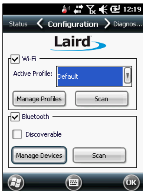
Figure 2: Configuration tab